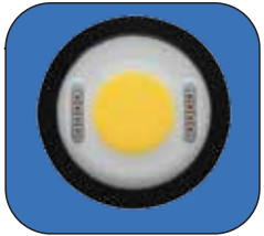
COB LED to provide 15000 lumens