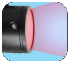
Built-in red color led enhances focusing performance